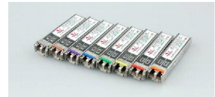
CWDM SFP Transceivers