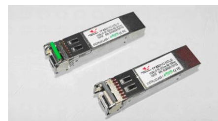
10Gbps SFP+ Transceivers