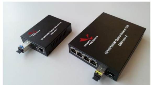
10/100/1000M Optical Media Converters