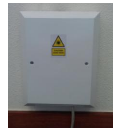
Wall-mount Fiber-to-Home Optical Node (ONU-Mini_1)