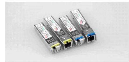
BIDI SFP Transceivers (SC or LC)